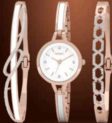
46. Allure Watch and Double Bangle Set

Show off your sophisticated style when you wear this expensive looking rose gold plated watch, 3ATM water resistant, with high precision Japanese movement quartz, and matched with eye-catching two bangles adorned with radiant crystals. Wear this set with any ensemble from business casual to everyday wear for a polished look.