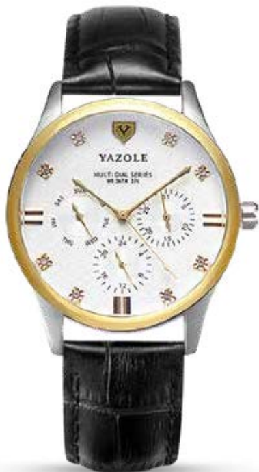
58. Gold Chronograph Mens Watch

A distinguished watch for everyday wear. Features a quartz 6 pointer movement with time in both 12 and 24 hour format, day and date, encased in a gold bezel and stainless steel back with vegan-leather black stitched straps. 3 ATM water resistance.