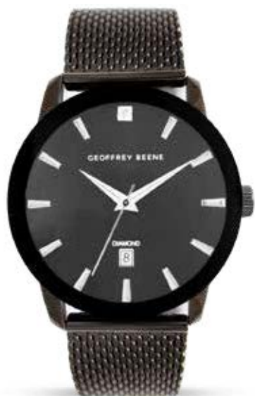
54. Manhattan Collection Gunmetal Gents Watch

This classic yet contemporary timepiece inspired by the uniqueness of New York City features a contemporary stealth like gunmetal dial. An alloy metal case, stainless steel case back and adjustable mesh band ensures durability.