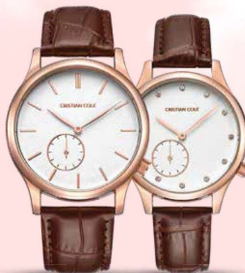
57. His & Her Watch Set

Complete your look as a couple with Cristian Cole's stunning His and Her watch set. Modern looking watch casing in rose gold with brown leather strap. A little sparkle to her and simplicity for him, we have watches to show off your style together!