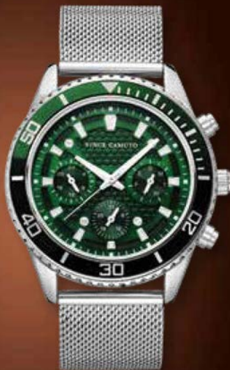
47. 44mm Silvertone Steel Mesh Green 3 Eye Dial

44mm analog round silver-tone stainless steel mesh band watch. Features silver-tone coin edge bezel with green top and a silver-tone numeral seconds track. Multi-zone green dial with silver-tone hands and markers. Dial features day of the week, date, and 24-hour sub dials. Polished silver-tone stainless steel mesh band with stainless steel sliding adjustable buckle closure. Splash resistant.