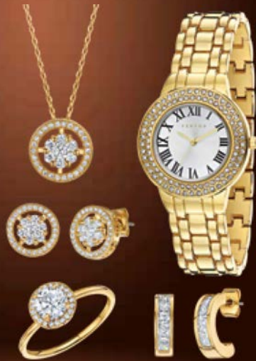
45. Elegante Watch and Jewelry Set

This captivating watch and jewelry set from Fervor Montréal includes a gold plated watch (Japanese movement and splash resistant) bedecked with crystal accents along with 2 pairs of earrings, a matching necklace and a size adjustable ring to compliment the look. All presented in an elegant black gift box.