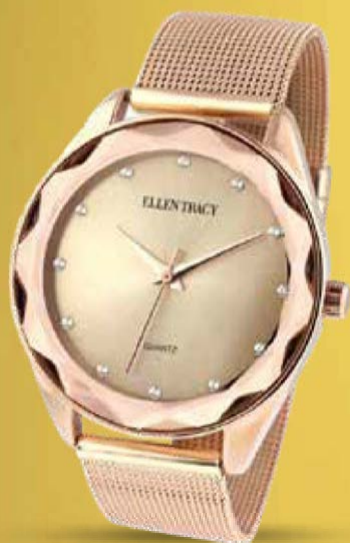
52. Elegance Collection Rose Gold Ladies Watch

The Elegance Collections features a Rose Gold Tone stainless steel adjustable mesh strap, faceted mirrored glass & a 12 stone index sunray dial.