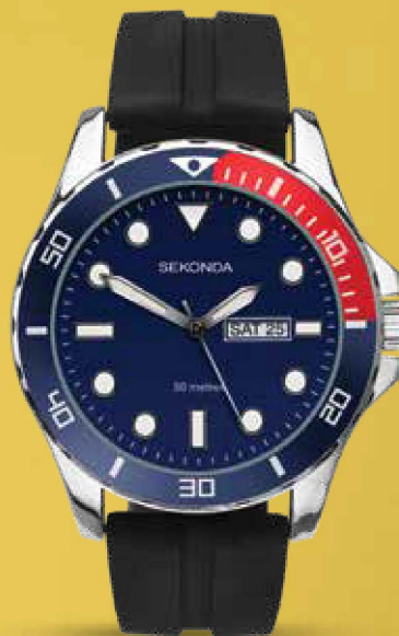
51. Blue Dial with Batons Gents Watch

This Sekonda gents watch features a blue dial with day/date and rubber strap. Water resistant to 50m.