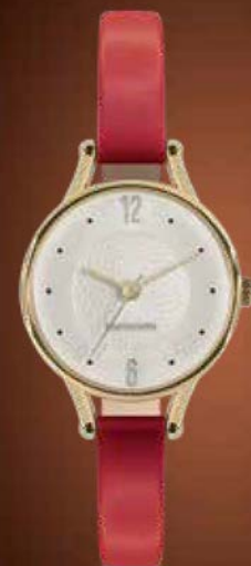
48. Piccolo 26 Leather Watch Gold White Red

Petite and chic fashion accessory with gold plated case and Italian leather straps. 30m water resistance.