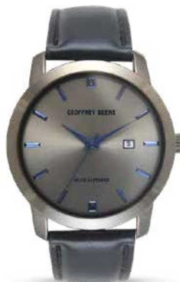
55. Manhattan Blue Sapphire Collection Gents Watch

The Manhattan collection is a classic yet contemporary timepiece inspired by the uniqueness of New York City. This style features a contemporary decorative chronograph, gunmetal sunray dial, blue sapphire accents.