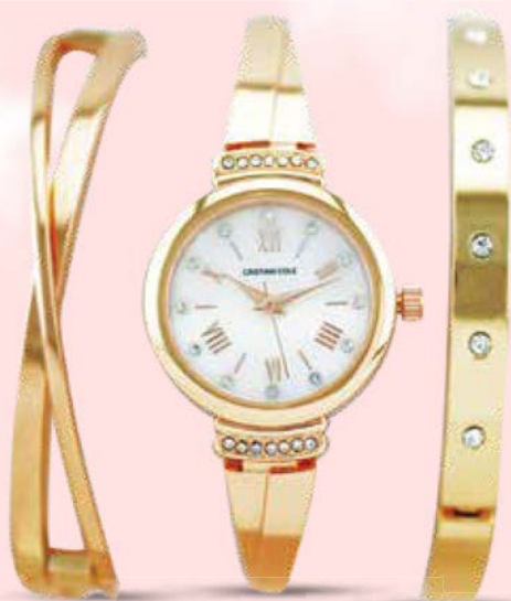
56. Glittering Watch & Bangles Set

Finding matching accessories can be something of a nightmare for the modern woman, but Cristian Cole has solved that problem with this glittering watch and two bangles gift set. The watch itself is a standalone head-turner, with its pearly white face offset by a jewel encrusted case and with two stunning Jewellery-clasp closure bangles. This sparkly duo will complement any evening gown or cocktail dress, enabling her to shine on that next big occasion.