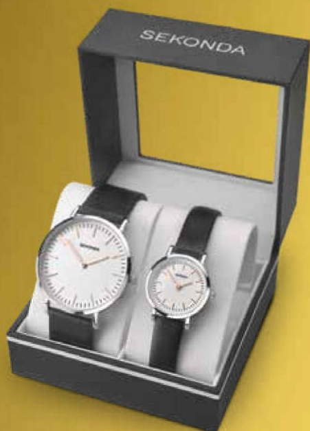
50. Ladies & Gents Dual Gift Set

This contemporary ladies and gents dual gift set is brought to you by Sekonda. The matching watches feature a white dial with batons. With black straps completing the look, these watches are perfect for every occasion.